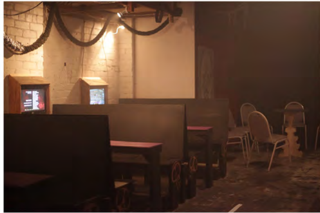
Figure 6. Foil piping, 19-10-12.

In Figure 5 we see a front-on shot of the foil covered tables and a plaster head perched upon the bench. Exposed pipes or tubing frame the image, which have also been encased in foil. The space successfully creates an ambience of fun and play, the DIY approach loosely applied, apparent in the details as seen on the edges of the seats and the small rips in the foil. In an FBI radio interview entitled 'Early Underground', Michel Freeman interviews Luke and Seb (members of Sub Bass Snarl), who discuss attending an event in the 1980s where an entire basement on George Street, Sydney was covered in foil. This act, an homage on the part of the hosts to the earlier event, connects the space aesthetically to the former rave culture and to its allied ethos.