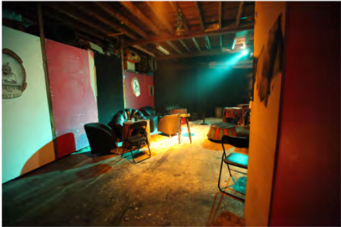
Figure 3. Green light, 7-10-11.