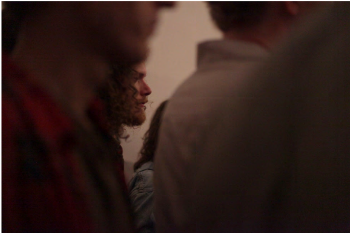
Figure 7. Beard face, (Photograph taken by Author, 2011).

This complete immersion is demonstrated in Figure 7. This particular gig was in a very small room, the temperature was hot, and it was almost hard to breathe, like stepping into a car that has been left in the sun all day. As I am quite short, the view of the performers was almost entirely blocked out. With no intention or way to push to the front, I experienced the performance in glimpses and sounds and through the faces of those who could see, those taller than me, those with a better vantage point. Enjoyment and concentration etched on their faces, beers poised at their lips, appreciation shared between people discussing a song or experiencing a moment.