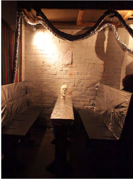
Figure 5. Foil head, 4-5-12, (Photograph taken by Author, 2012).