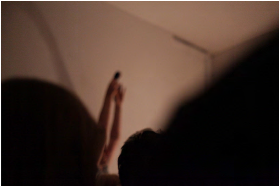
Figure 8. Camera high, (Photograph taken by Author, 2011).

As you can see in Figure 8, at this particular gig another photographer is experiencing a similar height-constraint and is raising their camera in the air as an attempt to capture a more holistic view of the band and audience. Not only does this cause increased visibility and attention to the photographer, but it is also not a practice I would generally engage in, based on years of experience photographing bands. However, in the spirit of trying new things, I raised the camera and took a picture, the image was blurry, but more than that, it reinforced an immeasurable disconnect between the image and myself. It was as though I was looking at an image someone else had taken, due to the fact that my eye had not been pressed to the viewfinder and I had not consciously framed and deliberated over the actors captured.