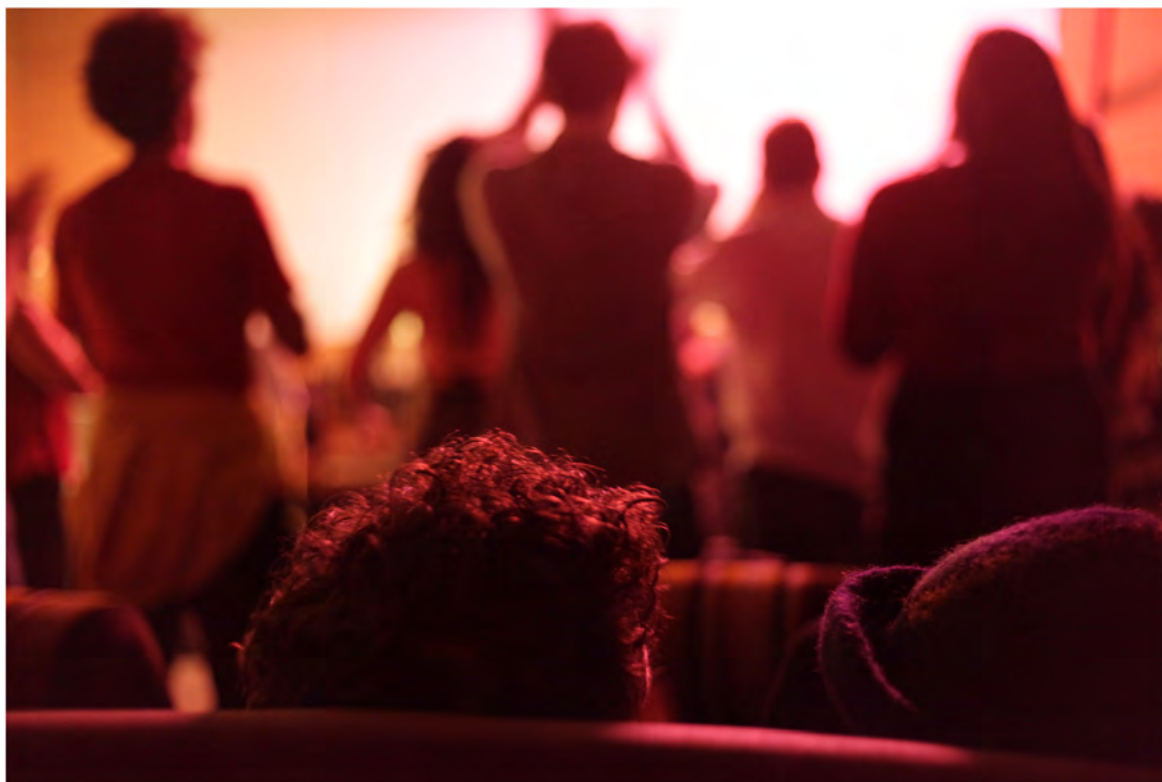
Figure 9. Your view, (Photograph taken by Author, 2012).

While this was an option for capturing the space, it was at this point that I really understood how vital my experience of the space was to the documentation. If I felt cramped to the point of claustrophobia inside a space, as I did in Figure 7 then that needs to be translated to the viewer. This project, as previously expressed, is not about the performer on stage and capturing the best angle of the lead singer, it is about contextualising a phenomenological understanding of space and place as explored experientially through the lens of my camera. While the heat in this space was unbearable, the vibe was electric and it was from here that I took comfort in the confines of other bodies around me. When a space was not necessarily full or the audience were sitting (this is often due to the kind of performance that requires attentive listening) I too would sit, (as seen in Figure 9) and shoot through the people watching, or shoot from the perspective of others in the room, wanting to capture what it was that they were experiencing, as opposed to a superficial view. Engaging in these practices began to solidify my place as an empathetic insider.