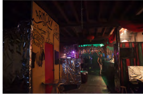
Figure 4. Armoury, 4-5-12. (Photograph taken by Author, 2012).

In Figure 2, I capture what I first glimpsed from the threshold. That is, two dismembered and disfigured dummies bathed in two pools of contrasting light, one red, and one green. The curling stitches swirl across the bare chest of the female torso and the lighting creates two very different reactions to these strange actors.